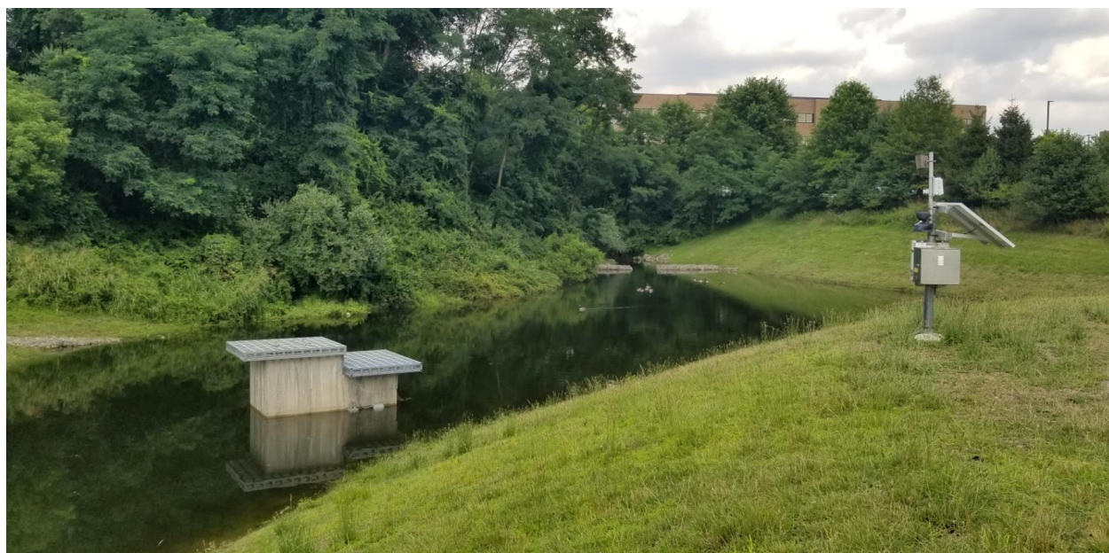
Image: WalMart pond after 2018 retrofit