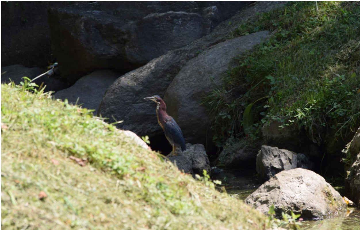
Image: Green heron in the WalMart stormwater pond during the retrofit

The County works closely with residents on a daily basis to implement stormwater practices in their yards and provide education and outreach through several departments and a variety of programs. The Office of Community Sustainability kicked off a pilot commercial program with a successful partnership with WalMart to retrofit the Ellicott City WalMart's stormwater pond in 2018. This type of retrofit utilizes a new state-of-the-art technology based system and requires minimal machinery and disturbance to the ecosystem during construction. Utilizing telemetry based forecasts, the pond is able to be drained ahead of a large storm event in order to capture an increased volume of water. Capturing more, or all, of the water volume from the storm event, prevents an initial large flush of water and associated contaminants, from flowing out of the pond overflow to the stream during large rain events. This retrofit also provides some flood control at the headwaters of the Tiber Hudson Watershed. We anticipate this successful partnership to serve as a model for future commercial partnerships going forward.