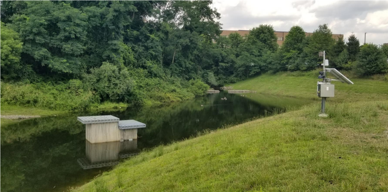
Image: WalMart pond after 2018 retrofit